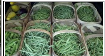
A bountiful harvest for the hungry. Mills River Youth go out every month to serve in the community as a "Labor of Love."