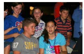
Hanging at the Bonfire