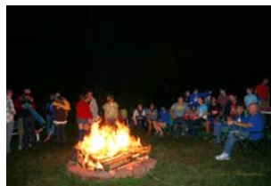
5th Quarter Bonfire