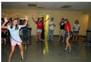
Hula Hoop Contest - 5th Quarter