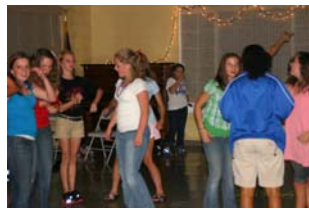
Dancing at 5th Quarter